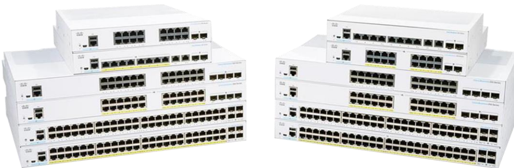
Figure 2. Cisco Business 250 series smart switches

The Cisco Business 250 Series is the next generation of affordable smart switches that combine powerful performance and reliability with a complete suite of the features you need for a solid business network. These switches provide flexible management options, comprehensive security capabilities and Layer 3 static routing features far beyond those of an unmanaged or consumer-grade switch, at a lower cost than for fully managed switches. When you need a reliable solution to share online resources and connect computers, phones, and wireless access points, Cisco Business 250 Series Smart Switches provide the ideal solution at an affordable pricing point.