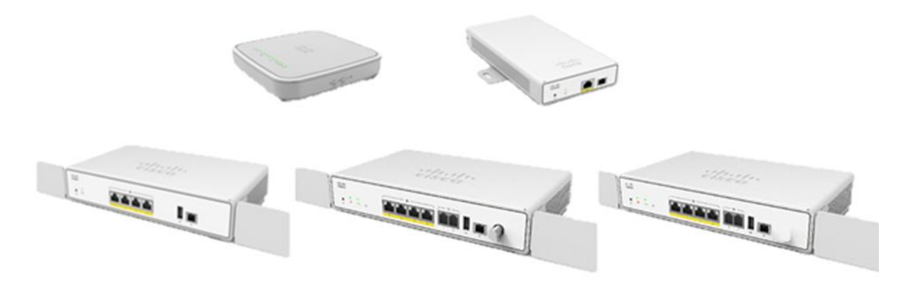
Figure 2. Cisco Catalyst PON ONT